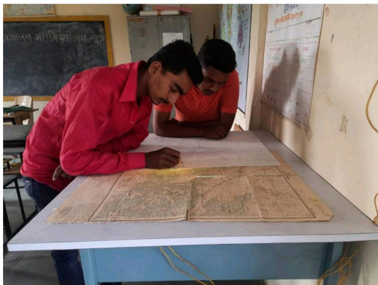
BA Spl Geography Practical – Trashing Table