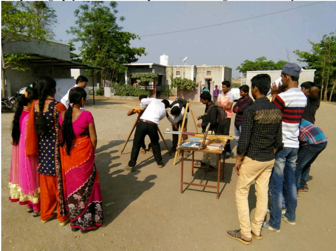
SYBA Spl. Geography Students are Completed on the Ground Survey on Dt. 04/02/2020