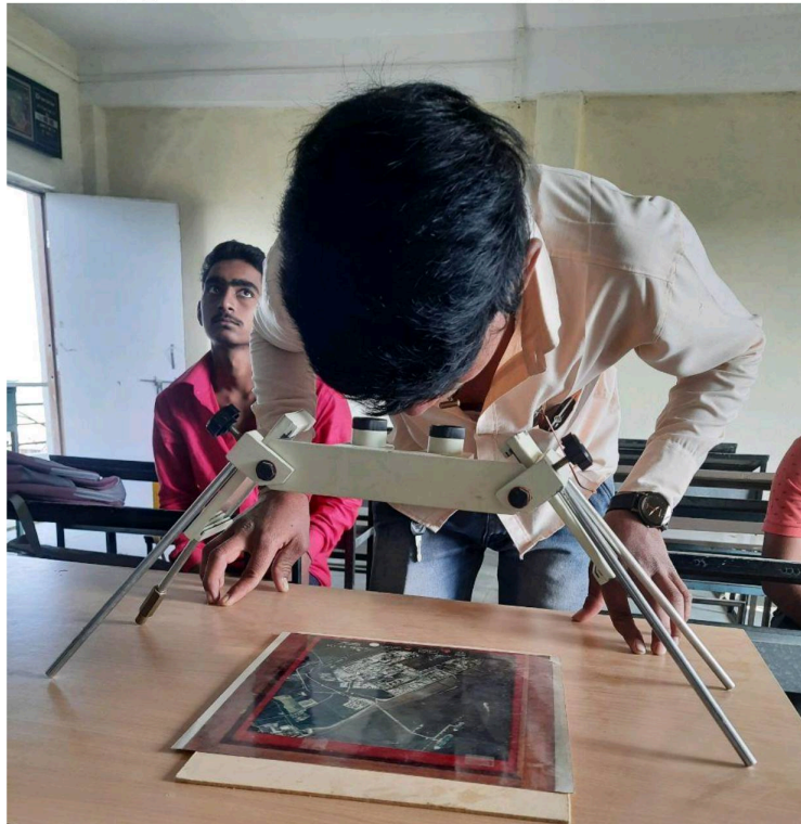
Arial Photography Observation in Stereoscope (Geography Practical)

Student are actively participated in regular Geography Practical Classes.