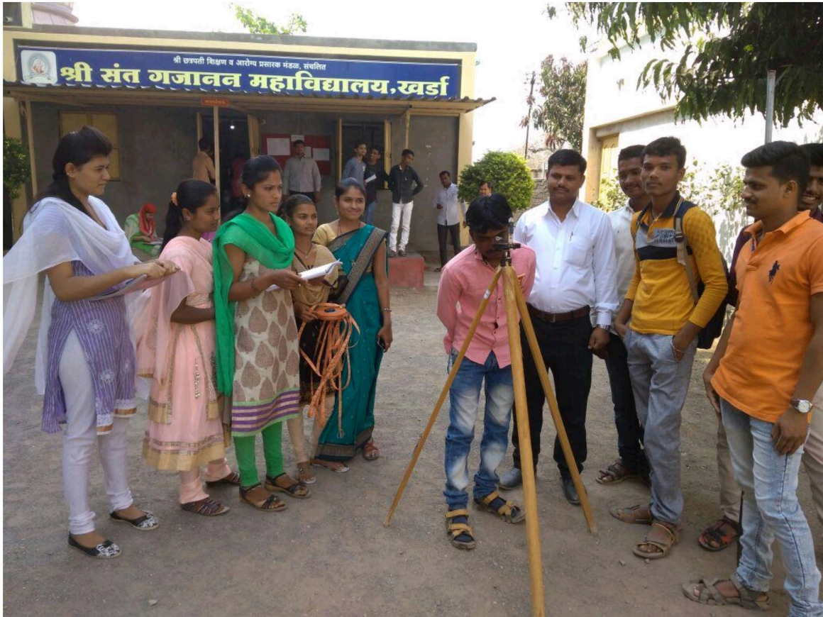
SYBA Spl. Geography Students are Completed Under College Ground Survey on Dt. 08/01/2019

Students are actively involved in College Ground & Land surveys conducted by the Department of Geography. These surveys are helpful for students in their knowledge about Practical Geography.